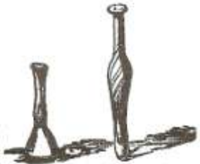
Lacrymatoria, from specimens in British Museum.

lac'ry-má-tō-ry, n. [L.L. lacrimatorium , properly neut. of lacri- matorius , of or pertain- ing to tears, from L. lacrima , a tear.] One of a class of glass ves- sels or phials found in sepulchers of the an- cients, in which it has been supposed the tears of a deceased per- son's friends were col- lected and preserved with the ashes. Also called lacrymal .