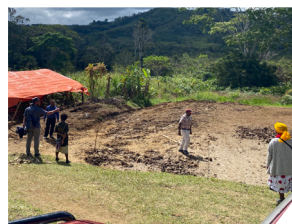
The leveled church ground

We were just informed this week that our home church is sending money for us to build a little clinic on station. This will be a huge blessing as this ministry continues to grow. Please pray that this compassionate ministry would help people to come to Jesus, and that we would be efficient and successful in building this structure over the 2nd half of this year!